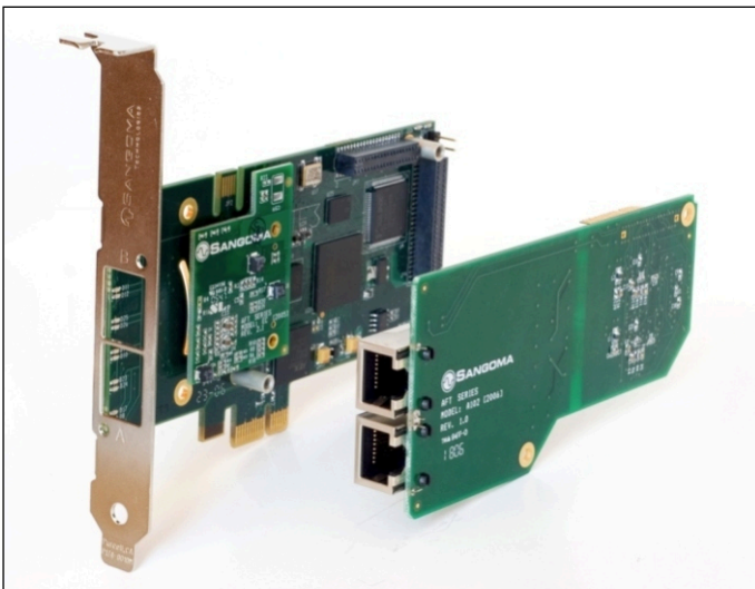
A102 PCI Express disassembled

The A102 is the dual port version of Sangoma's family of Advanced, Flexible Telecommunications (AFT) hardware designed for optimum support of voice and data over T1, E1 and J1